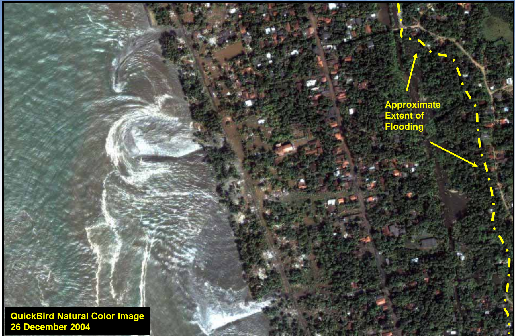
QuickBird Natural Color Image 26 December 2004