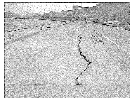
Damage caused by foundation settlement in Ofunato (photo courtesy of National Research Institute for Earth Science and Disaster Prevention).

Also observed were some large cracks in roads, several landslides, and rock and debris falls. Damage occurred from foundation settlement and liquefaction. There was also interior and exterior nonstructural damage, including damage in many cemeteries. A typical failure was tombstone rotation or toppling. The economic loss is estimated at US$97.3 million. The Tohoku Earthquake Disaster Investigation Committee will investigate ground motion, performance of buildings and lifelines, injuries, and damage to historical buildings. A link to Motokasa's full report can be found at EERI's home page at www.eeri.org .