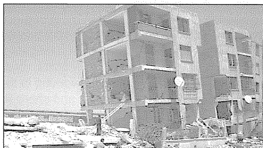
Multistory buildings sustained damage due to failure of columns.