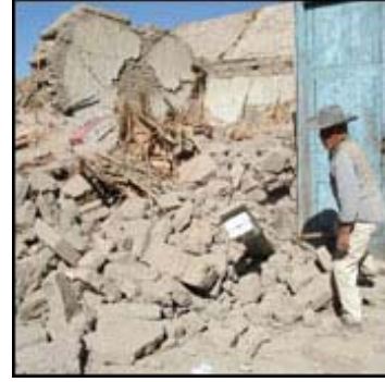
Figure 2 Collapsed homes in the region (from “La Nación”).

Sources: The information in this article was obtained through telephone interviews with local authorities, from articles published in Chilean newspaper “La Nación,” [ www.lanacion.cl ], University of Chile and CISMID (Perú) reports, and interviews broadcast on the Peruvian radio station. “Radio Uno” [ www.radiouno.com.pe ]