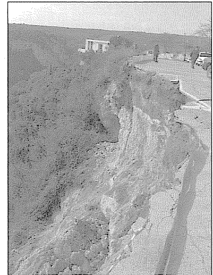
Landslide at Mitata (Photo: E. Lekkas).

The full report by this investigation team as well as another report from the Institute of Engineering Seismology and Earthquake Engineering in Thessaloniki can be found at http://www.eeri.org/lfe/greece.htm . A USGS report can be found at http://neic.usgs.gov/neis/eq_depot/2006/eq_060108_hrak/neic_hrak_ts.html .