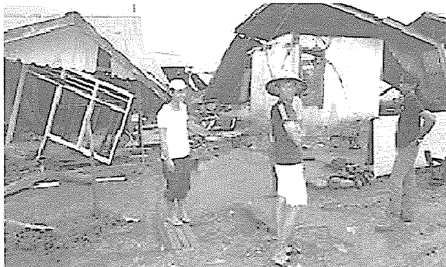
Residential damage on Enggano Island.

Indonesia's islands are often hit by earthquakes. At least 34 people died last month when a magnitude 6.5 earthquake hit central Sulawesi and some neighboring islands. The worst earthquake to hit Indonesia in the last decade was in December 1992, when a magnitude 7.0 event and a subsequent tsunami killed about 2,500 people on a string of eastern islands, including Flores Island.