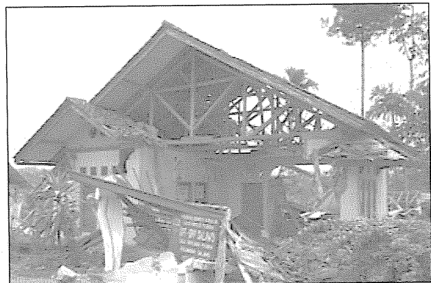
Figure 2. A building with confined masonry walls failed due to low-quality materials and poor workmanship.