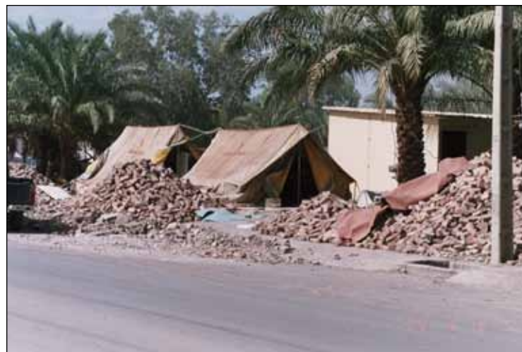
Figure 4. Tent shelters placed among piles of debris. Some residents are still living in tents next to debris from their homes (photo: Tierney).

Temporary housing and residential reconstruction: At the time of this reconnaissance visit, the vast majority of displaced households were still living in tents, most of which had been provided by the Red Crescent Society. At the insistence of residents, the majority of these tents had been placed on private property near homes that had been destroyed. Other tents were erected in congregate camps, while still others were located on streets adjacent to former dwellings. Tent camps are being used mainly to house former renters and migrants from the nearby villages. The tents are very small, and the vast majority have no capacity for