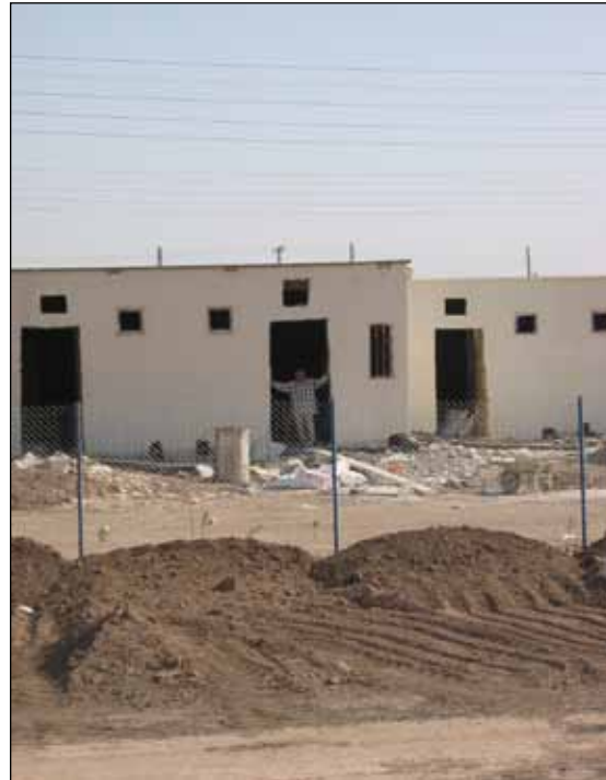
Figure 6. Resident looks out from temporary housing structure. Although units are still under construction and not approved for occupancy, some families have already moved in.

Government agencies will provide a range of services to residents, from debris removal and site preparation to design review, inspections, and the enforcement of price controls to prevent price-gouging. At the same time, homeowners will be able to choose home designs and building materials, within constraints set by reconstruction authorities. Housing reconstruction is already underway in the villages surrounding Bam. Much of this work is being