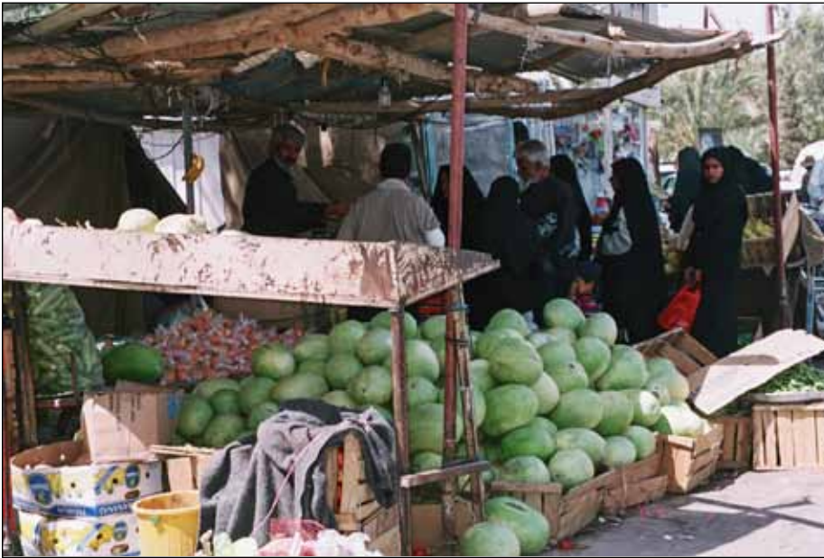
Figure 3. Temporary market. Many businesses now operating in Bam were not doing business in the city before the earthquake.

itable. Nearly all of the housing in Bam and in eight to ten villages within 10 km of Bam must be replaced. Adobe and nonengineered buildings accounted for 80% of the residential building stock. Additionally, rapid and uncontrolled development in recent years resulted in the construction of many unsafe buildings.