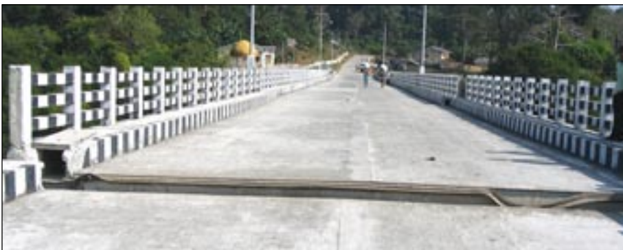
Figure 10b. Detail of the bridge deck showing lateral and vertical displacement due to shifting of the decks on their neoprene bearings.