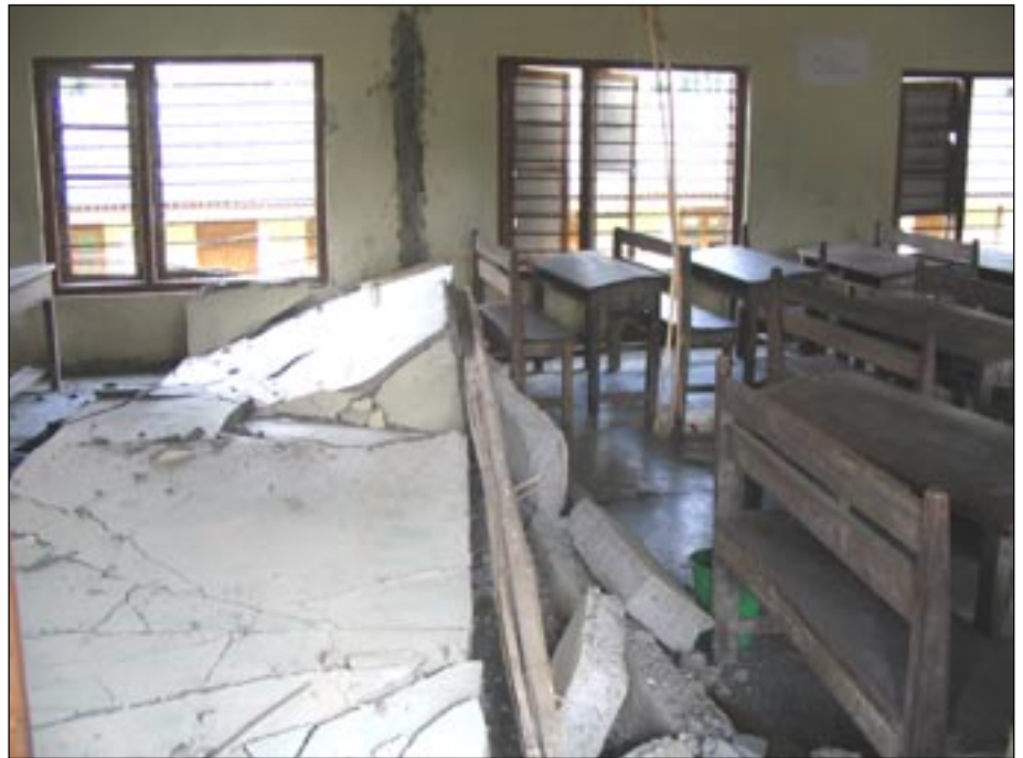
Figure 8. Slender masonry walls dislodged due to out-of-plane instability and poor or no connection to the surrounding structural elements.

Damage to Infrastructure: A newly constructed 268 m-long RC bridge over the Austen Strait, connecting the North and Middle Andaman Islands on the Andaman Trunk Road, had to be closed to even light vehicles. Three middle spans of the superstructure were displaced laterally by about 70 cm and vertically by about 22 cm and fell off the bearing (Figure 10). Some other spans were also