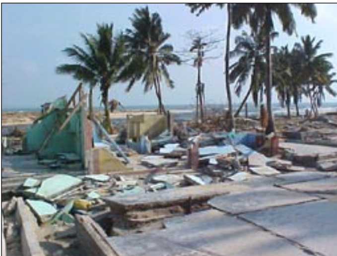
Figure 6. General destruction of built environment at Hut Bay in Little Andaman Island.

Often, in masonry dwellings with load-bearing walls and light roof trusses made of either steel pipes or timber, walls are not tied together to create lateral resistance. Large