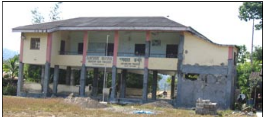
Figure 9a. The Panchayat Bhavan building showed severe cracking and damage to the soft first-story columns and infill walls.