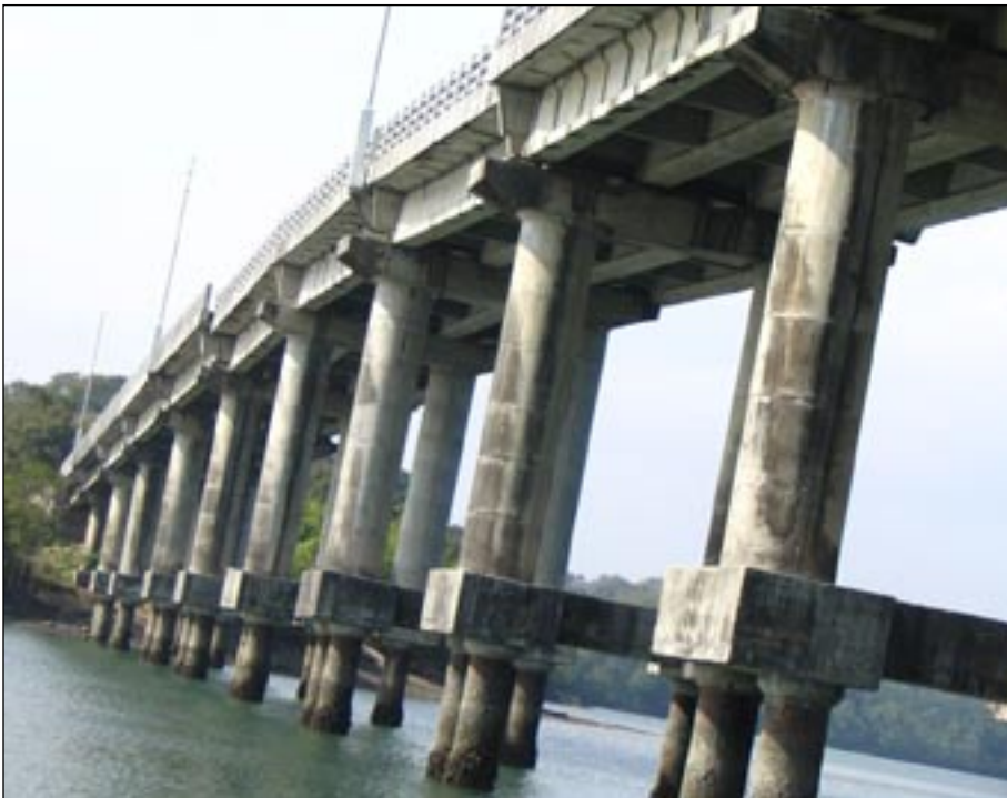
Figure 10a. Chengappa Bridge over Austen Strait was rendered dysfunctional by displacement of the middle spans.

The main source of electric power is from captive diesel-generator power plants. The 20 MW Suryachakra power plant in the Bamboo Flat area of Port Blair was adversely affected by the tsunami waves, which flooded the entire plant. Severe damage to mechanical and electrical equipment from the sea water