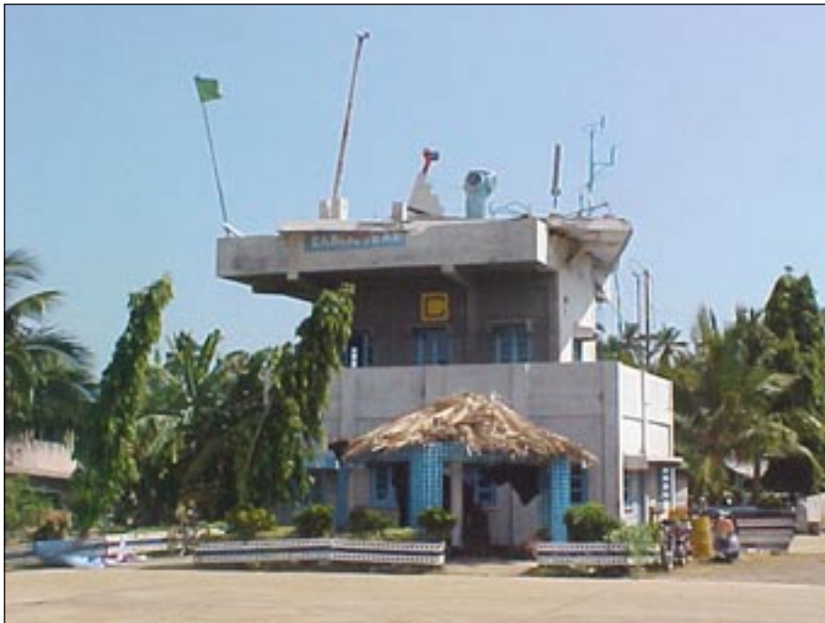
Figure 12a. Partial-collapse of the upper storey of the air traffic control tower at airport on Car Nicobar Island.