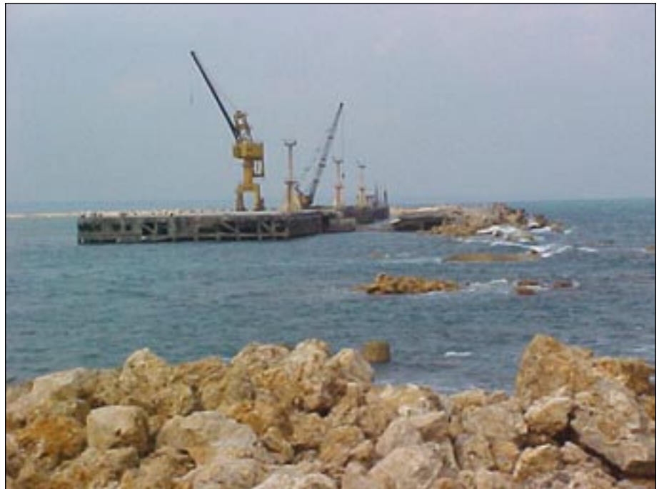
Figure 11. Shortage of appropriate construction material forced the use of porous coral stones from local quarries for building the breakwaters. The stones were easily uplifted during the tsunami and breached a large segment of the approach to the RC jetty at Hut Bay.

Emergency Response: Though the entire Andaman & Nicobar Islands have been classified in the highest Indian seismic zone (V) and have had a history of earthquakes