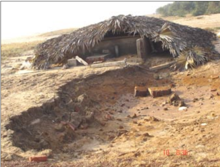
Figure 15. Mud house with thatch roof built within 100 meters of the sea at Pakala Beach in Andhra Pradesh.

toppled at numerous places along the coast. Communication towers were also damaged or destroyed.