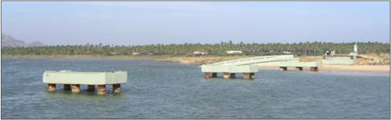
Figure 17. Complete loss of spans of the four span RC bridge at Melmannakudi in Tamil Nadu.

2001 earthquake, and SIFFS had been very active with the fishing community across the affected states. The large number of volunteers working in these NGOs significantly helped in the assessment of needs, the soliciting of useful relief materials, and the distribution of them.