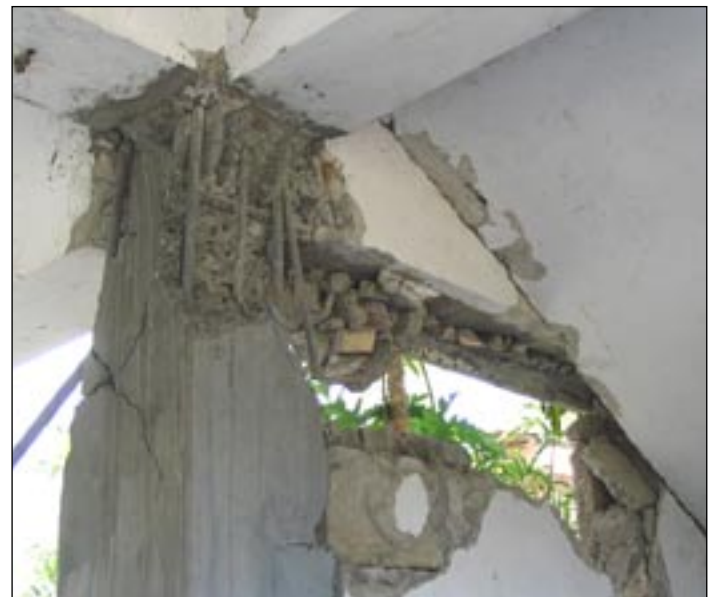
Figure 9b. Detail of column failure in the ground story.