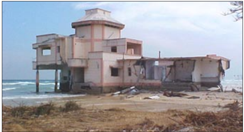
Figure 3. RC frame building (MES Inspection Bungalow) now stands in water on the eastern coast of Car Nicobar Island (photo: C.V.R. Murty).

deaths. However, as a percentage of the total population, the statistics from the Nicobar Islands indicate the most severe losses: out of the total population of 42,068, about 1,395 are reported dead, 5,764 missing, and 27,497 were in the relief camps (as of March 10, 2005). Most of the tsunami victims on the mainland belonged to the fishing community or lived in houses within 500 m of the water. Tourists in Velankanni in the state of Tamil Nadu and morning walkers in urban areas (Karaikal, Chennai and Pondicherry) were also among the dead. Since December 26 was the day after Christmas, many visitors came to the seacoast for a holy bath on an auspicious day, and lost their lives.