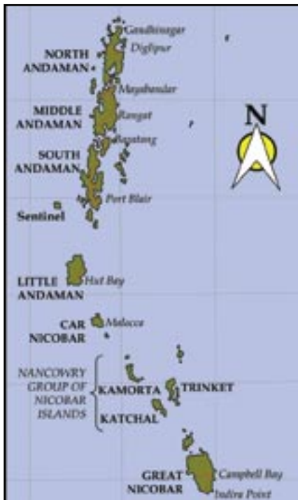
Figure 2. Overall map of A&N Islands showing some of the larger islands of the region.

The total number of Indian fatalities were 10,805, with over 5,640 persons missing, according to official statistics ( www.ndmindia.nic.in 2005). The state of Tamil Nadu had the highest number of fatalities — 8,010 ( www.tn.gov.in/tsunami 2005) — with the district of Nagapattinam alone accounting for 6,065