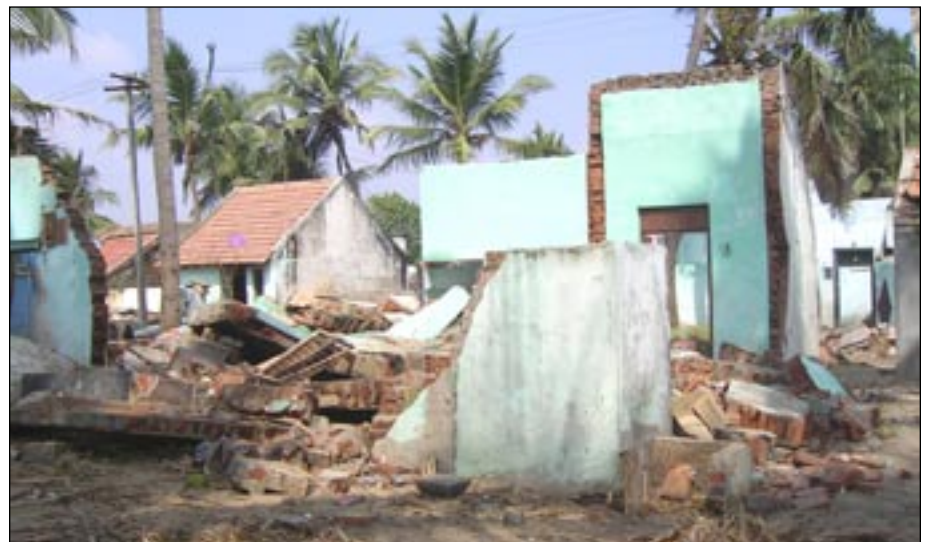
Figure 14. Houses destroyed by the waves at Nagapattinam in Tamil Nadu.

Bridges and culverts were affected. At least three bridges were damaged, with one of them losing all four spans (Figure 17). Roads suffered significant scouring at numerous places along the coast, as did railway lines. Road embankments were eroded. Compound walls