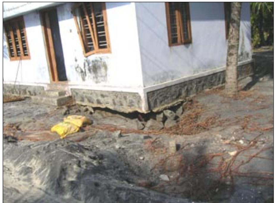
Figure 16. Scouring action at the base of houses due to returning wave of the tsunami in Kollam district in Kerala.

Relief was more timely on the mainland than in the A&N islands. The television focused on the disaster in the areas adjoining Nagapattinam, which brought a large number of NGOs to the area. To systematize the relief efforts, an NGO Coordination Cell was set up with the help of three NGOs: the South Indian Federation of Fishermen Societies (SIFFS), Nav Nirmaan Abhiyaan (Gujarat), and ACCORD (Nilgiris). Of these, Abhiyan had done considerable work in Gujarat after the