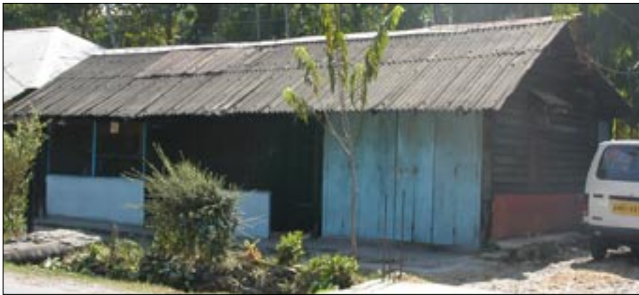
Figure 5a. Single-story wood house in Port Blair with light roof had no damage.