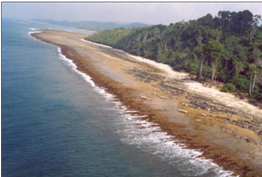
Figure 4. Up-throw of coral beds and rock strata due to uplift on the western coast of Middle Andaman Island near Flat Island.

The tsunami waves caused severe destruction in the coastal areas of the southern islands (Figure 6). Structures near the water were subjected to (1) a positive water pressure when the waves arrived, and (2) a suction pressure when the waves receded. A large number of buildings right on the water in Little Andaman and Car Nicobar islands were washed away, regardless of how they were constructed.