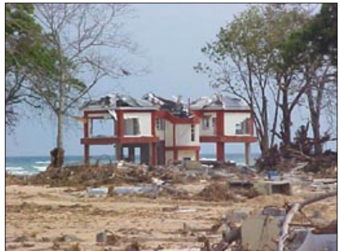
Figure 7. Shore-front building on Car Nicobar Island was inundated by the waves, but the frame resisted the wave effects.