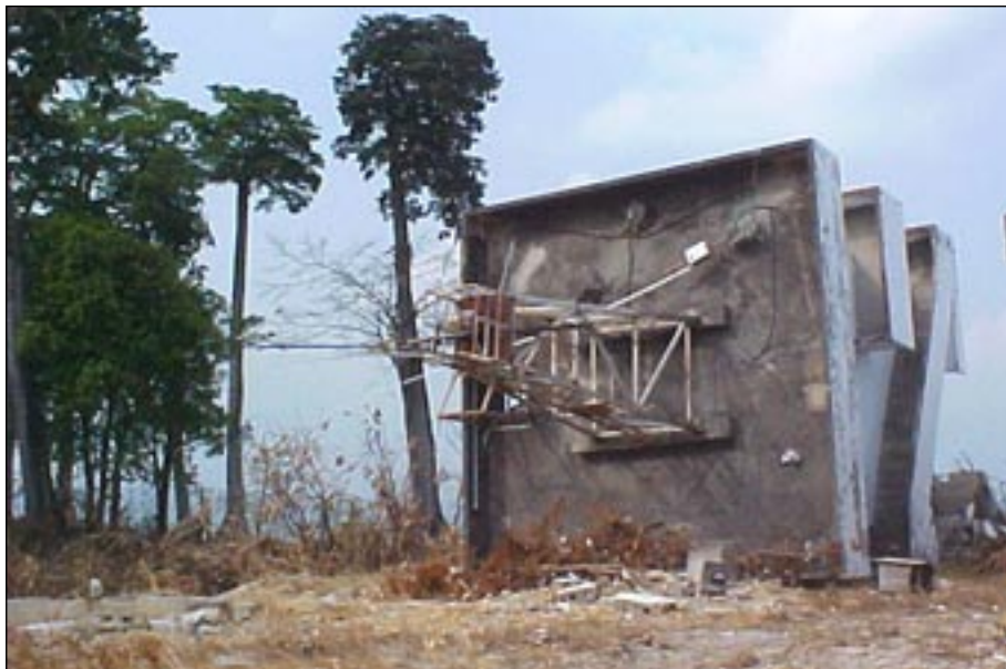
Figure 12b. Laterally toppled three-storey seaport traffic control tower at Hut Bay in Little Andaman Island.

implemented, with army, navy and the air force reporting to the same commander-in-chief. Initially, the defense officers had handed over relief materials to the civil authorities on the island and had not been involved in their distribution. After the formation of the IRC, and in view of complaints of uneven relief distribution, the armed forces post-