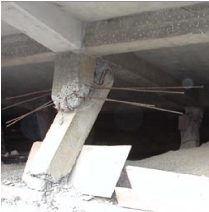
Figure 5b. A three-story RC frame building in the same town collapsed in a brittle manner.

However, an occasional well-designed RC structure was seen standing even in the devastated areas. In the best of the cases, the frame of the infilled building was intact, while the infills were pushed out of plane (Figure 7). In some cases, where there were a number of buildings in a row normal to the shore, the waves destroyed the structures towards the shore, but buildings in the rear were shielded. However, the number of buildings that survived is a very small fraction of the total houses near the shore.