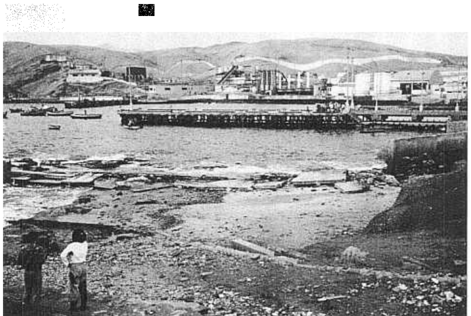
Figure 1 - Destruction of the wall at the Port of Culebras. The maximum runup of more than 5 m was measured at the nearby ravine.

The coast of Peru in this area is arid with areas of wind-blown sand. The beaches are of two main types: the coastal area north