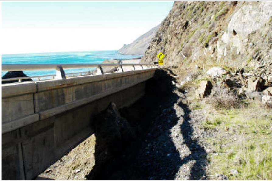
Villa Creek (State) Bridge (44 0028) in Monterey County.

Villa Creek Bridge, seven miles north of San Luis Obispo County, was the only Caltrans structure that was damaged during the earthquake. This is a five simple-span, precast girder structure on Highway 1, along the Pacific coast. The deck is supported on tall single column bents. The bridge was recently retrofit, which didn't protect it from a rockslide that put a hole in the northeast girder web. However, this damage did not reduce the girder's ability to carry traffic and the bridge remained open following the earthquake.