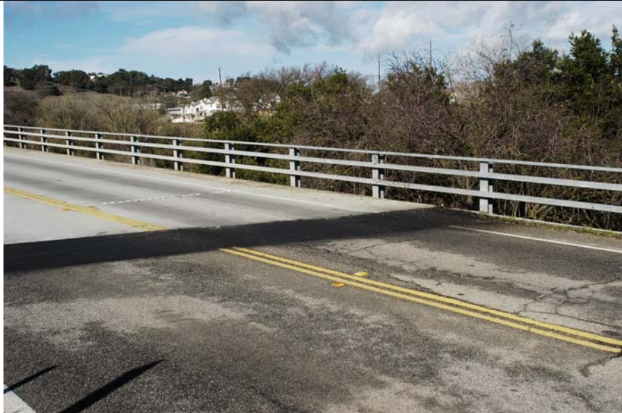
Templeton Road (County) Bridge (49C 0177) less than a mile east of I-101 in San Luis Obispo County.

Villa Creek Bridge, seven miles north of San Luis Obispo County, was the only Caltrans structure that was damaged during the earthquake. This is a five simple-span, precast girder structure on Highway 1, along the Pacific coast. The deck is supported on tall single column bents. The bridge was recently retrofit, which didn't protect it from a rockslide that put a hole in the northeast girder web. However, this damage did not reduce the girder's ability to carry traffic and the bridge remained open following the earthquake.