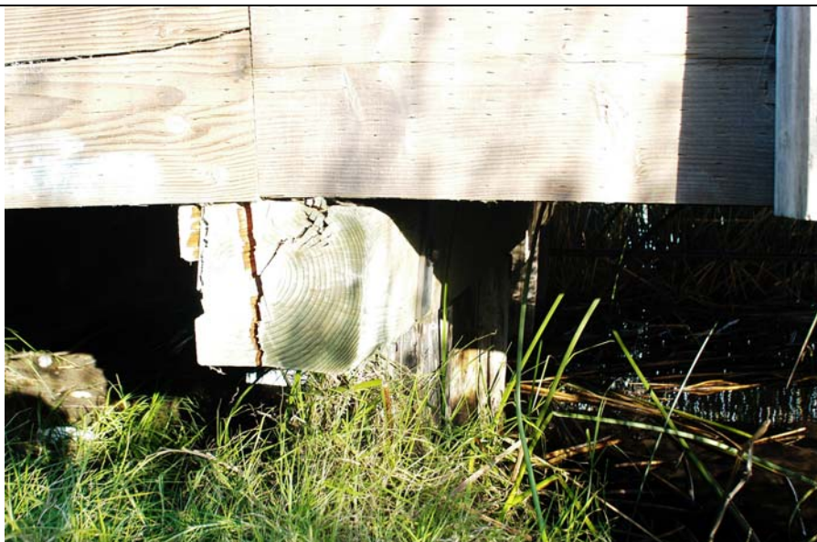
Lakeside Ave (County) Bridge (49C 0126) in Oceano.

The Templeton Road Bridge spans over the Union Pacific RR and the Salinas River. The west two spans are CIP girders and the east five spans are RC box girders. The superstructure is on flared, single column bents with piles and on seat and end diaphragm abutments on spread footings. The bridge was not retrofit. Most of the damage was due to liquefaction, settlement, and shaking of the superstructure. The approaches settled about 5 inches. The barrier rail and utility lines were also damaged. Soil borings were taken before a chip seal was placed at the approaches.