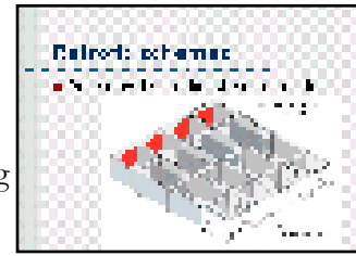
retrofit approach in Taiwan