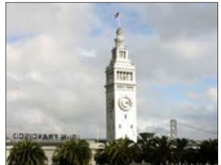
A 100th Anniversary Earthquake Conference field trip destination: The seismically retrofitted San Francisco Ferry Building.

In addition, longer bus trips will leave San Francisco at the conclusion of the conference and make several scheduled viewing stops, visiting plate boundaries and more distant faults in the region, open fault trenches, and offsets. These longer trips will run through the weekend. Of the approximately 25 tours, four will be repeat trips. It is anticipated that roughly 25–30% of the conference attendees will take part in one or more technical tours.