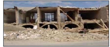
Damage to traditional houses in villages of the region.

For more information on this earthquake, visit http://www.iiees.ac.ir/English/index_e.asp .