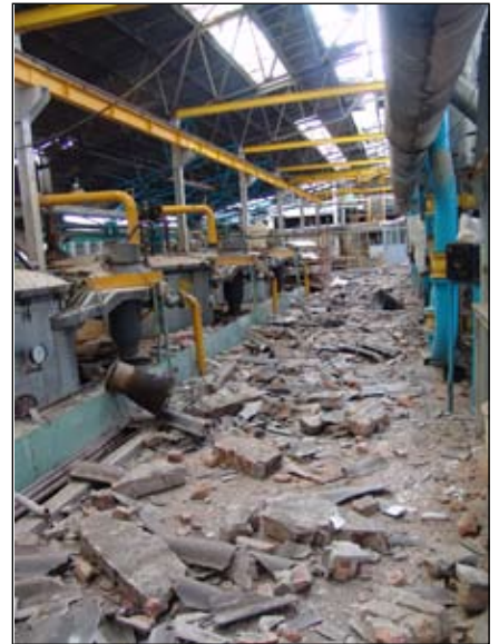
Substantial damage to the equipment of a sugar factory caused by fall of masonry infill panels.