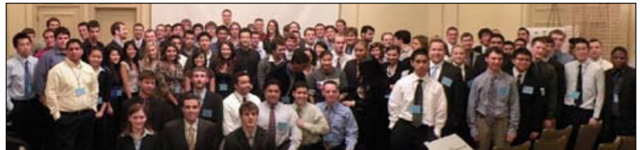
Participants in the 18 teams that vied for honors in the 6th Undergraduate Seismic Design Competition held during the Annual Meeting.