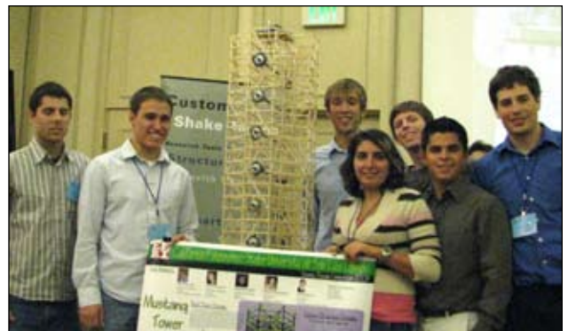
Cal Poly's team placed first in the Student Design Competition.