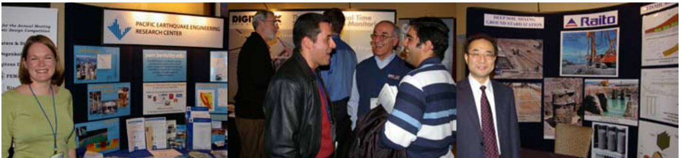
Subscribing Members on display during the Meet the Mentors Reception.