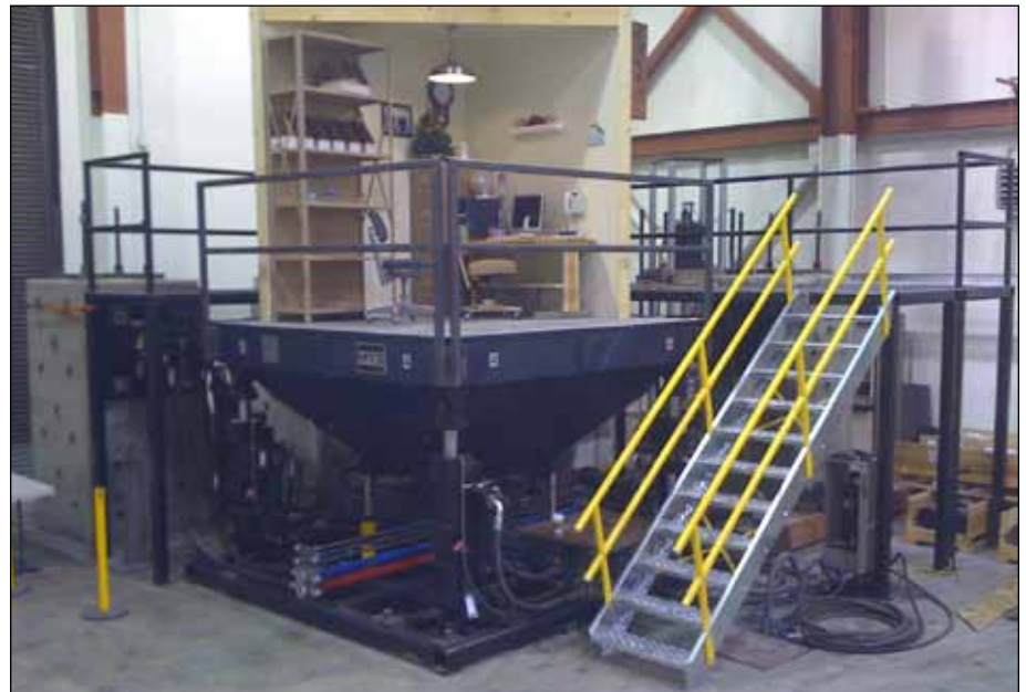
A typical office was built and tested on the new triaxial 50-ton-capacity six degree-of-freedom shake table at UNR's CCEER.

To view the web cast of the entire anniversary demonstration, visit http://cceer.unr.edu/events/cceer25th.html .