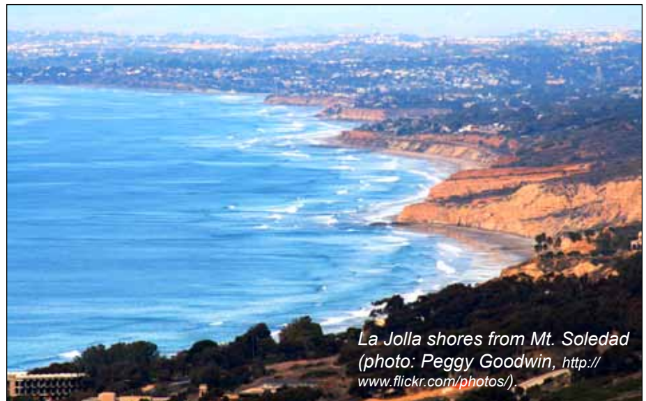
La Jolla shores from Mt. Soledad

See page 6 for more Annual Meeting News.