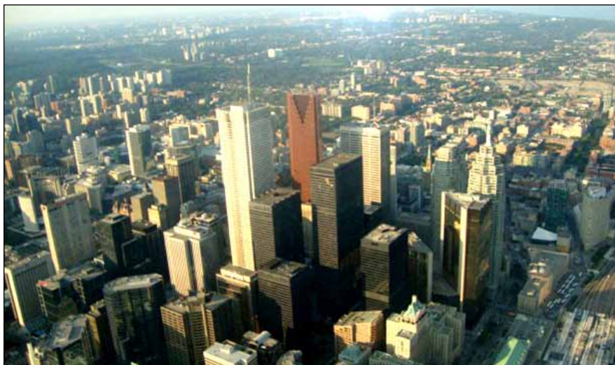
View of Toronto from the CN Tower's Observation Skypod.