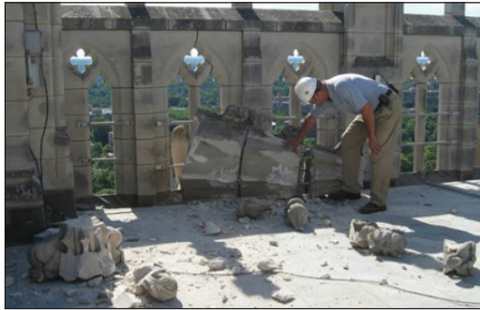
Pinnacle damage at the National Cathedral in Washington, D.C.

At 1:51 EDT on Tuesday, August 23 rd , an M 5.8 earthquake with its epicenter in northern Virginia, 135 km (84 miles) SW from Washington, D.C., shook most of the East Coast, with people reporting shaking from Georgia to Canada. Seismic waves are able to reverberate with little attenuation and travel long distances in the eastern United States, which is mainly composed of older rock that has not been frac-