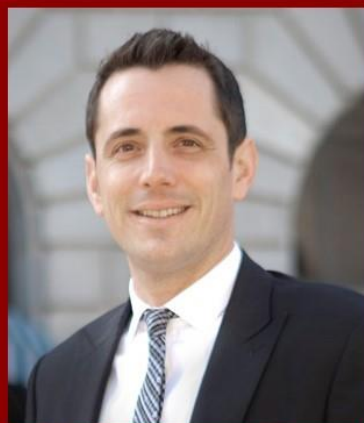
Chief Resilience Officer, San Francisco, CA