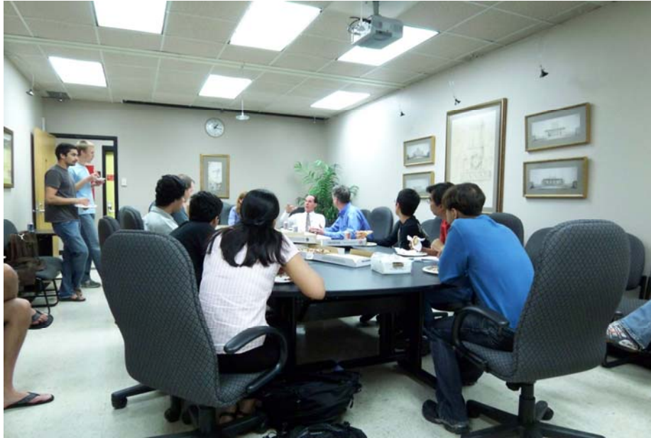
Figure 2 Reception