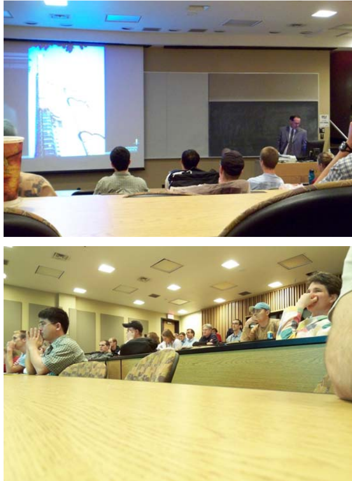
Figure 1 Seminar