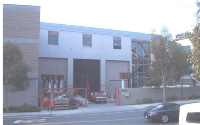
(left) Charles Lee Powel Structural Systems Laboratory;, (top right) Viscous Damper recently tested in SRMD, photo taken after the visit with damper out of the testing assembly; (bottom right) Structural Components Laboratory