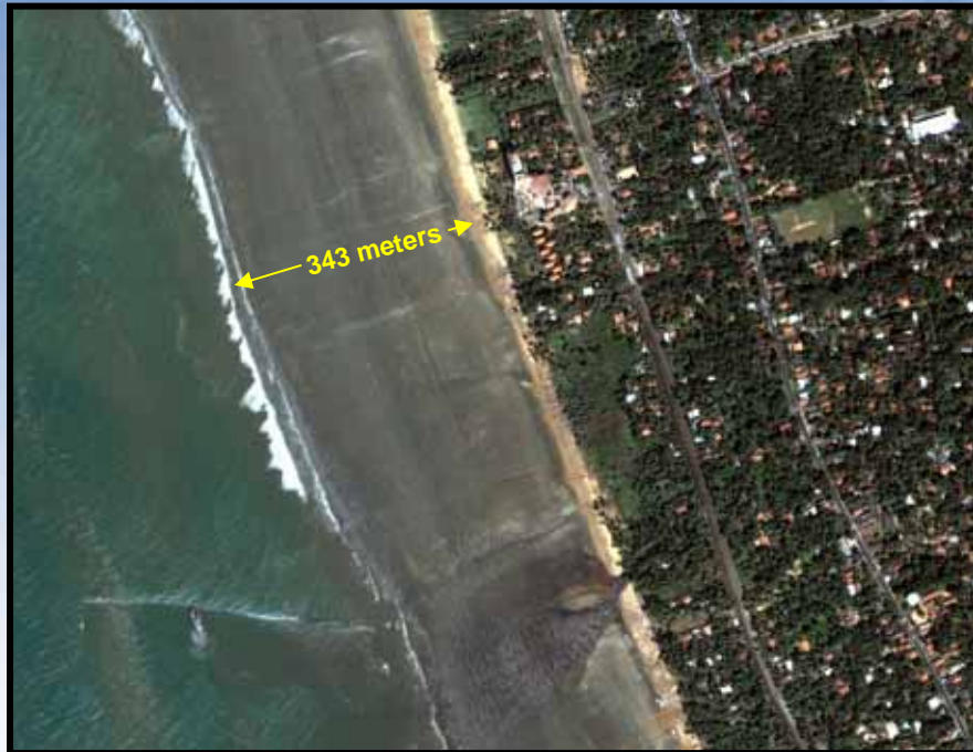
QuickBird Image 26 December 2004