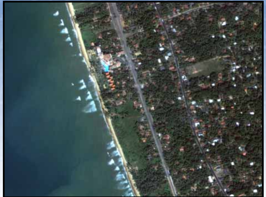
QuickBird Image 1 January 2004