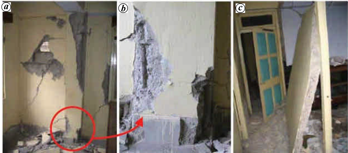
Figure 6. Damage in residential building at Deorali. a , Severe cracking in infill walls and damaged RC column. b , Exposed mild steel in damaged RC column; and c , Out-of-plane failure of infill wall.