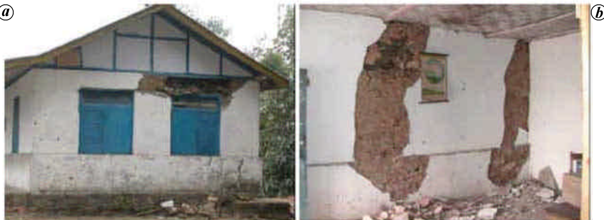
Figure 4. a, b , Severely damaged stone masonry low-cost school buildings in Sikkim. (Government Primary School, Thamidara near Gangtok).