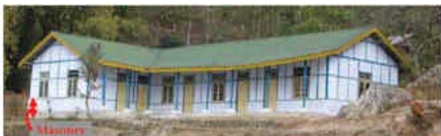
Figure 2. Traditionally constructed typical Ikra structure in Sikkim (school building at Nandok, East Sikkim).

major event in these seismic gaps in near future 8,9 . It has been reported that there were large-scale damages (intensity VII and above) in Sikkim after the 1897 and 1934 events 10-12 . It may be mentioned here that even smaller earthquakes of 1980 (Sikkim, M 6.0) and 1988 (Bihar–Nepal, M 6.5), have caused damage in Sikkim 4 . Therefore, there is possibility of widespread damage in the state during another major event in the seismic gap regions near Sikkim. The present earthquake of magnitude \sim 5.3 – 5.7 was comparatively small; hence damages caused by this event clearly indicate that the region is vulnerable to disaster in the future.