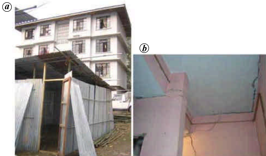
Figure 7. Four-storey government residential building (SNT colony) at Ranipool which suffered severe damage. a , Temporary shelters constructed using GI sheets in the backdrop of the RC quarters. b , Damaged columns and walls in one of the quarters.

evacuated. Severe damages were observed in several RC columns of the building, exposing mild steel bars as main reinforcement (Figure 6 a and b ). Poor material quality and poor connection between perpendicular masonry walls resulted in out-of-plane failure of one infill wall, and severe damage to other infill walls in the building (Figure 6 a and c ).