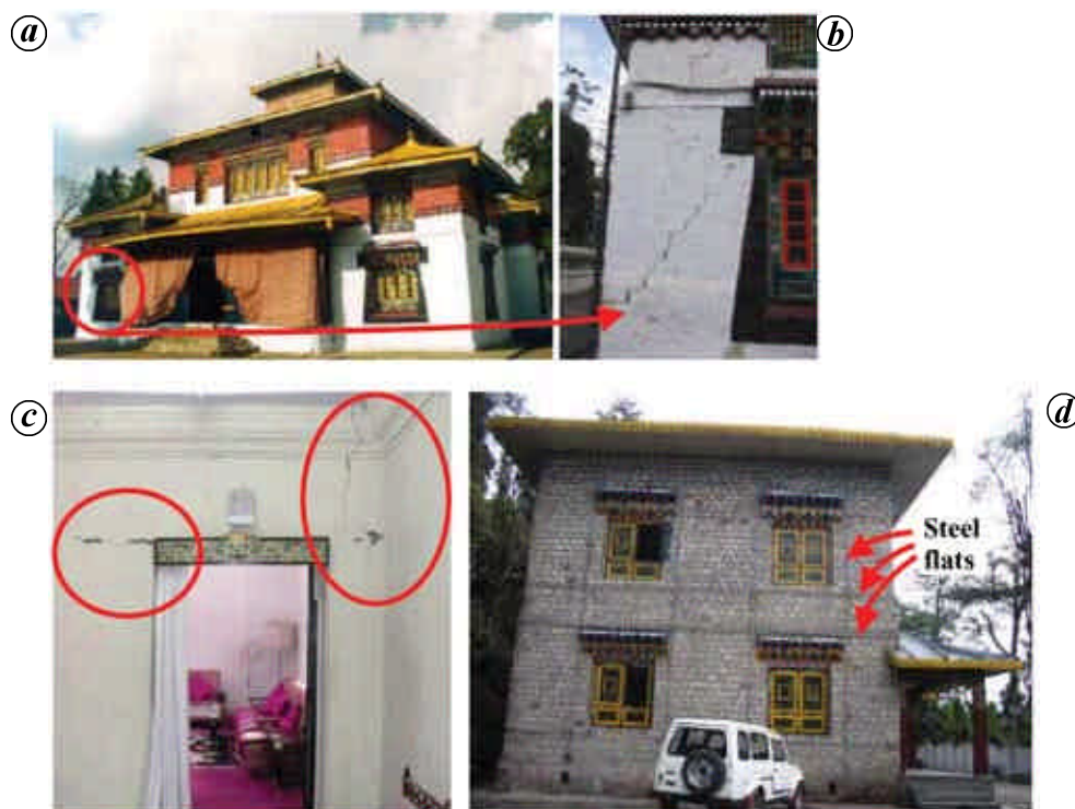
Figure 3. Performance of masonry structures at Gangtok. a, b , Wide shear and vertical cracks in masonry walls at corners and near openings in Enchey Monastery. c , Numerous cracks near door/window openings were observed at Raj Bhavan. d , Good performance shown by retrofitted Archive building (arrows show steel flats used to retrofit the building after the 1988 Bihar–Nepal earthquake).

bolts and nails. There were no reports of any significant damages to Ikra structures during this earthquake.