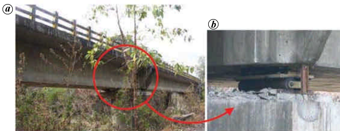
Figure 8. Two-span RC Tarkhola bridge between Melli and Rangpo appeared to be slightly damaged at the location of roller bearings on top of central pier. a , Bridge overview; b , Closer view of central pier cap showing spalling of concrete and insufficient lateral restrainer made of steel at the top of the pier.

There are several bridges on National Highway 31A, which connects Sikkim to the rest of the country. In the Tarkhola bridge between Melli and Rangpo, spalling of concrete was observed at the top of the central pier near bearings (Figure 8). One needs to ascertain if this was caused by the earthquake. Bridge-deck lateral restrainers, which can prevent the spans from dislodging-off the piers, were observed in most of the bridges along NH 31A. However, these steel lateral restrainers appeared to be insufficient in holding the bridge decks during severe ground shaking expected in seismic zone IV (Figure 8 b ). An RC pedestrian foot bridge constructed in 1989 near STNM Hospital, Gangtok sustained minor damage in the form of spalling of cover concrete in one RC beam due to corrosion of reinforcement bars. Horizontal cracks were observed in masonry walls of an RC office building of the Sanitation Section, Urban Development and Housing Department, Sikkim, constructed under the foot bridge at one end.