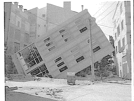
Foundation failure of a residential structure in Adapazari. Cause of failure: Liquefaction.

The earthquake is reported to have occurred on the North Anatolian Fault System at a depth of 10.5 miles. Preliminary reports indicate a right-lateral offset of nine feet with 37 miles of surface fault rupture. In addition to severe damage to thou-