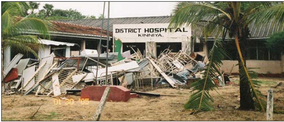
Figure 5. District hospital, Kinniya, Sri Lanka.

aster relief aid. These feelings appeared to extend beyond areas of life directly affected by the tsunami. For example, with little cash for bus tickets, children in one village now walk to school along a heavily traveled road, a source of chronic anxiety to residents. Villagers throughout many of the communities we visited, both in India and Sri Lanka, reported a sense of frustration and despair and were quite uncertain about their futures and those of their children.