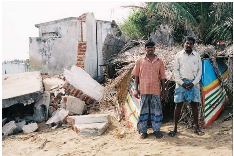
Figure 2. Destroyed housing in Sulerekuttukuppam, India.

In the communities we visited in Sri Lanka, residents were well aware of government discussions to “enforce” a 100-m buffer zone along the coast. We heard reports that the government had considered wider buffer zones, but was yielding to