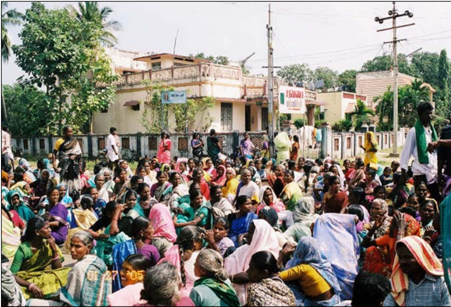
Figure 8. A protest of agricultural workers in Karaikal, India.

ture that could have assisted the survivors.