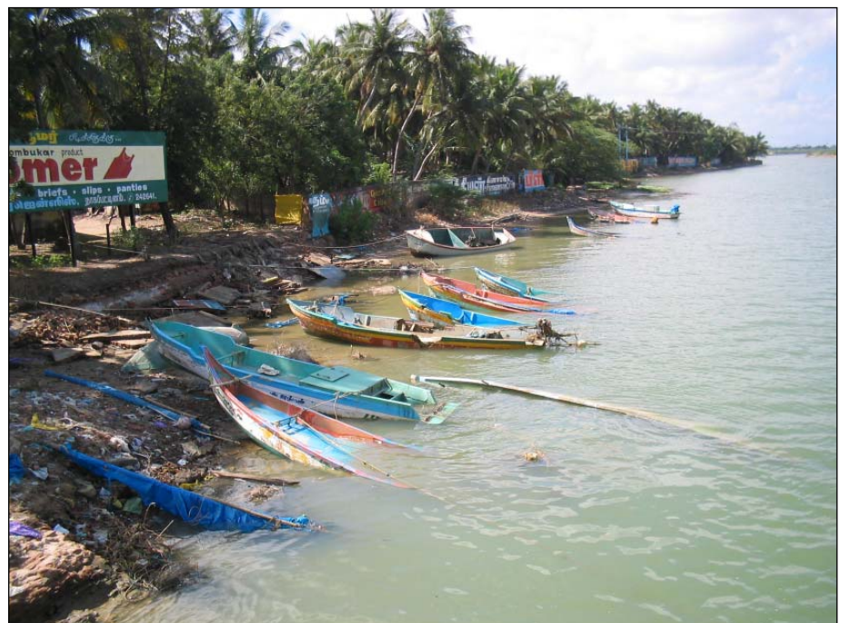
Figure 4. Fishing boats in Puddukuppan, India.

Uncertainty: Many of the residents in the communities we visited appeared to be living in a state of persistent uncertainty regarding when they would be able to resume their work, build new houses, resume "normal" community rhythms, and even determine whether or not it was safe to return to the shore. Rumors of the possibility of additional tsunami had spread widely and were reported to us by residents of many villages. While victims were beginning to engage in routine activities such as washing clothes, cooking, and gathering with others, many community members reported disturbed sleeping patterns and increased stress levels. While children in some communities had returned to school, others seemed far from a capacity to do that. To complicate matters, there was a high level of skepticism regarding the extent to which the government would fulfill promises regarding dis-