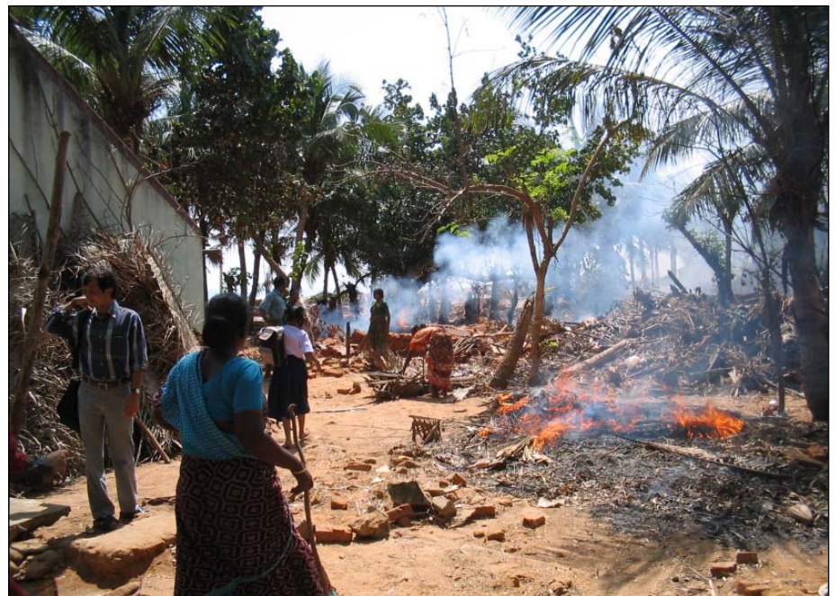
Figure 9. Women engaged in the cleanup process in Pudukkuppam, India.