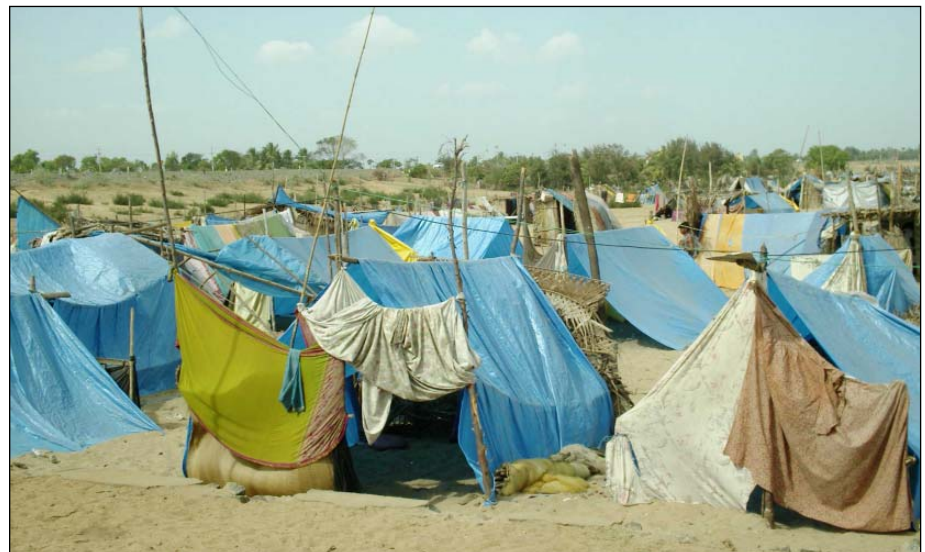
Figure 6. Makeshift shelters in Sulerekuttukuppam, India.

In some instances, NGOs duplicated efforts or provided assistance not suited to the locale or to the varying population sizes. In others, some communities received a great deal of assistance, while nearby communities received little or none from either the government or