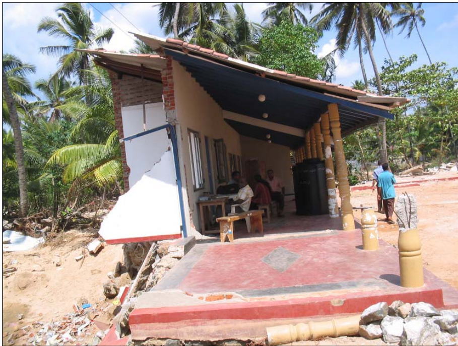
Figure 3. Damaged housing, south of Relief Camp Peraliya, Sri Lanka.

pressures to keep the zone at 100 m. We were informed that the government was considering relocating an entire community (Hambantota) that had been destroyed by the tsunami. On the other hand, the Indian government was reporting that it would enforce its coastal regulation zone that prevents building construction 500 m from high-tide point. Government sources suggested that fishermen relocated inland would be provided transportation to the sea, but fishermen questioned how long such support would last and the impact such a move would have. Other reports suggested that the sites being considered would put households at greater risk to flooding during monsoon periods.