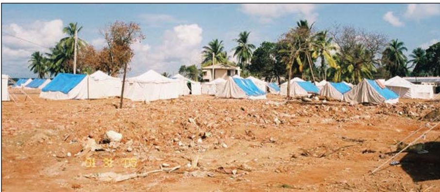
Figure 7. Temporary shelters in Hambantota, Sri Lanka, where once stood dozens of houses and a market.

Communities we visited in India and Sri Lanka lacked the necessary warning systems and knowledge to prepare for and respond to the tsunami. There were no preparedness efforts or disaster mitigation, nor was there any public or organizational training. More effective community capacity and effective early warning systems would have limited the catastrophic loss of lives and property. Beyond the appalling death toll, the tsunami also wrecked much of the community infrastruc-