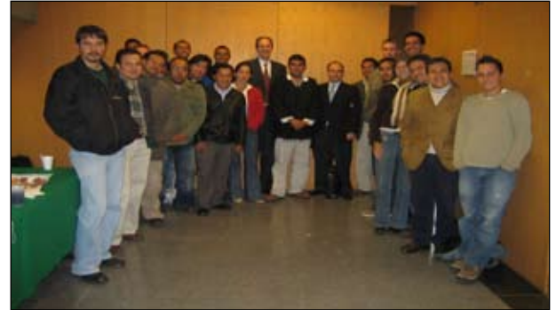
Students and advisors from UNAM and UBC at symposium in Mexico City

This joint project was developed by the EERI student chapters at the University of British Columbia and the Universidad Nacional Autónoma de México (UNAM), addressing confined masonry construction. Confined masonry construction has become one of the most prevalent forms of housing construction in the developing world. Various guidelines for confined masonry construction have been developed by different groups throughout the world in an attempt to encourage proper detailing and proportioning of confined masonry structures without the need for complex, and often conservative, code design procedures. The goal of this project is to develop a commentary to current guidelines so that informed designers (such as NGOs involved with reconstruction) understand the basis for the requirements in the guidelines and can make appropriate changes to achieve an earthquake-resistant design.