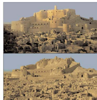
2003 Bam, Iran, Earthquake Reconnaissance Report