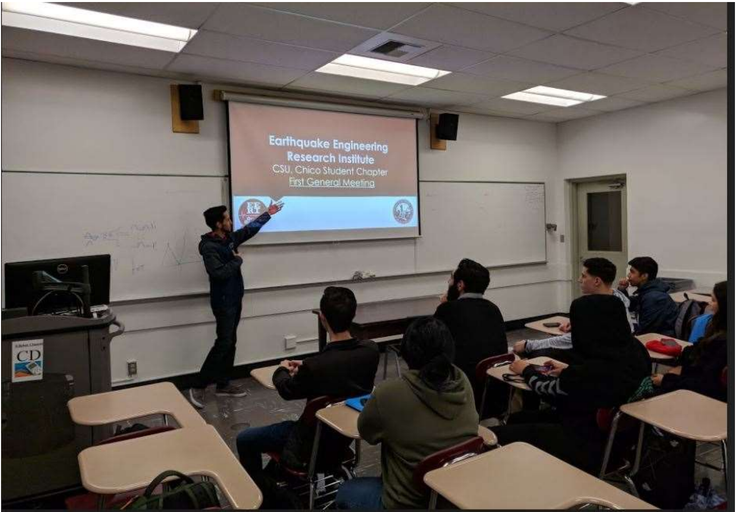
Item 1: EERI General Meeting Photo March 5th, 2019 @ Langdon 106