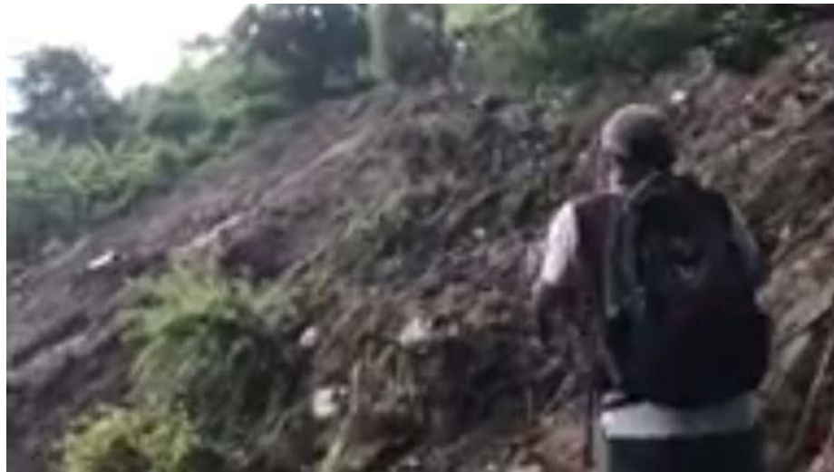
Landslide in simojovel that covered 11 houses