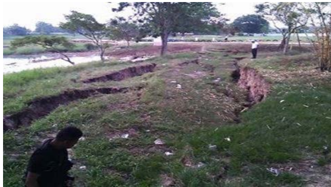
Lateral spreading in Jaltipan, Veracruz