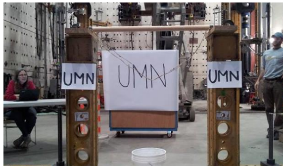
International Paper Truss Competition: Testing the EERI-UMN chapter truss

The student chapter entered the Paper Truss Competition, a competition among universities from Colombia, Turkey, Japan, and the United States. The EERI-UMN chapter took first place in the competition.