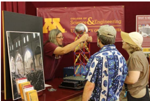
Testing of K'nex buildings

The EERI UMN student chapter promoted the understanding of earthquake engineering at the University of Minnesota College of Science and Engineering booth at the Minnesota State Fair. The booth was run by volunteers from the student chapter who conducted demonstrations covering shake-table testing of K'nex buildings, make-your-own-earthquake (MYOE) seismographs, and soil liquefaction.