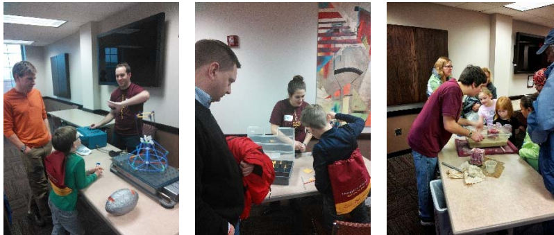
EERI Chapter in the Math and Science Family Fun Fair

The student chapter volunteered to run exhibits and activities at the College of Science and Engineering Math and Science Family Fun Fair, an event aimed at promoting the sciences to primarily grade school students. Activities included those from the Minnesota State Fair exhibit, but with a strong emphasis toward shake-table testing of structures constructed by the grade-school attendees.