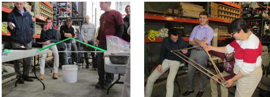
International Paper Truss Competition

The student chapter entered the Paper Truss Competition, a competition among universities from Colombia, Turkey, Japan, and the United States. Three teams entered the competition: grad students, a team from the shake table competition group, and a team from CE 5414.