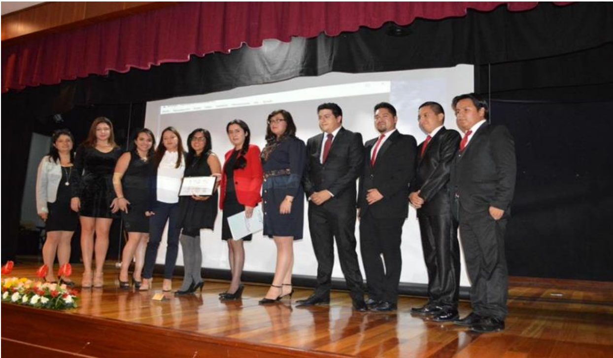
Public prevention workshop