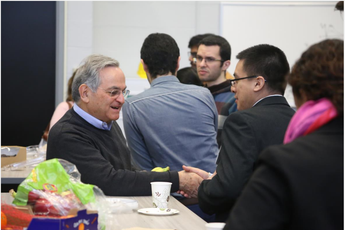
Breakfast and Coffee Hour