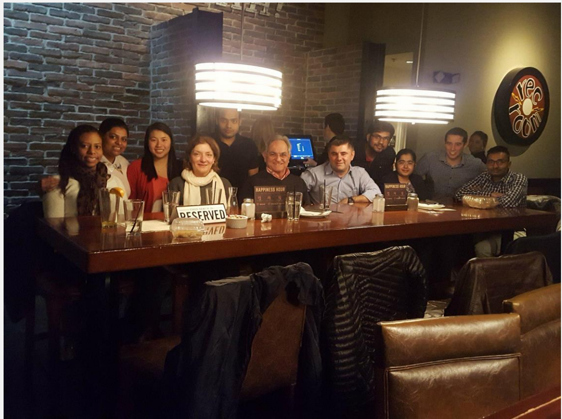
Dinner at Brickhouse Tap and Tavern